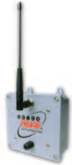
Quick Talk Monitor