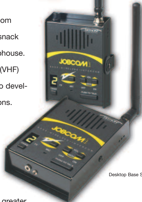
Desktop Base Station

The 2-way radio/intercom base station receives snack bar orders at your clubhouse. Built-in Weather Scan (VHF) also alerts personnel to developing weather conditions.