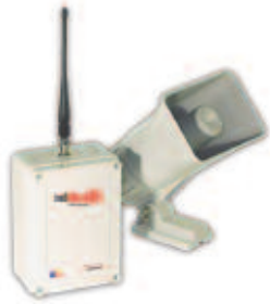
LoudMouth Wireless PA System

The Club Call system is also compatible with these Ritron wireless products!