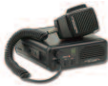
RPM 60 Series Mobile Radio

The Club Call system is also compatible with these Ritron wireless products!