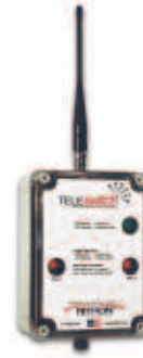
Teleswitch Wireless Switch Control