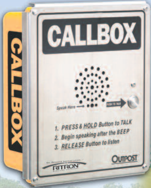
OutPost XT Callbox