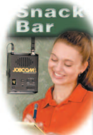
Wall Mount Base Station

The 2-way radio/intercom base station receives snack bar orders at your clubhouse. Built-in Weather Scan (VHF) also alerts personnel to developing weather conditions.